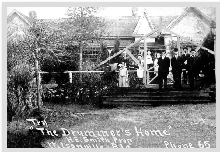
"The Drummers Home" Advertising Card, 1911.